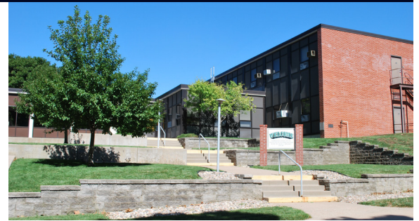
Front of the current school built in the 1950s

The Nebraska Instructional Resource Center (NIRC) is housed at NCECBVI and supports the local school districts and teachers of the visually impaired in providing