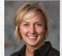
Sen. Lynne Walz Education Committee