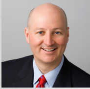
Gov. Pete Ricketts