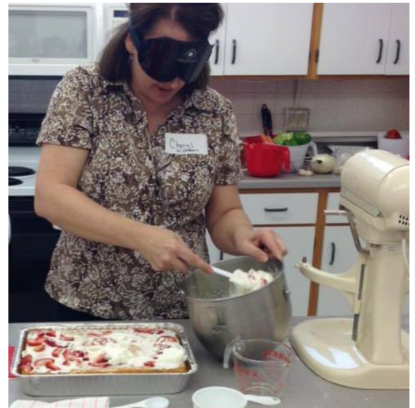
A parent baking a cake blindfolded at a parent workshop