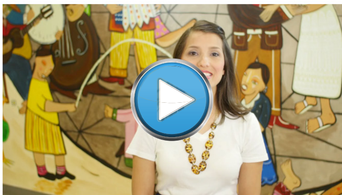
Thank You School Boards

Thank You School Boards – https://vimeo.com/300384374