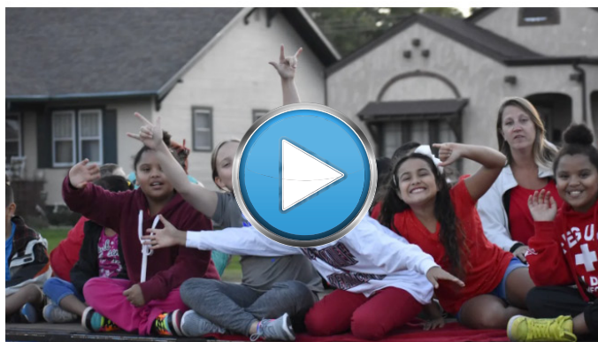
That's Why I Serve